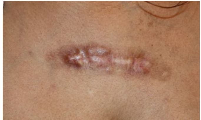
Figure 3. The same patient after surgery and radiation therapy. Note the recurrent disease along the surgical incision line (October 2017). Also, note that the small keloid papule that was previously present under the main keloid lesion, the one that was treated with ILT and cryotherapy, remained in remission for three years.