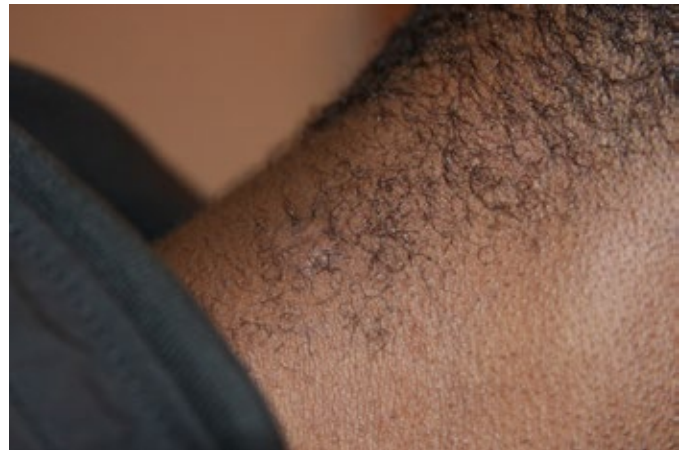
Figure 13. The same patient two years after treatment with cryotherapy (March 2015). Note the minimal scarring at the site of the treated keloid.