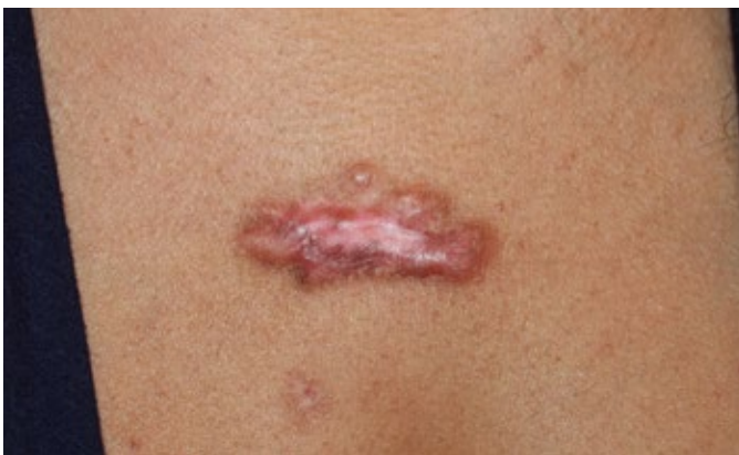
Figure 2. The same patient after recovery from three cycles of ILT and cryotherapy (July 2015). Note the thinning of the main keloid along with near-total flattening of the two keloid papules noticed at presentation.