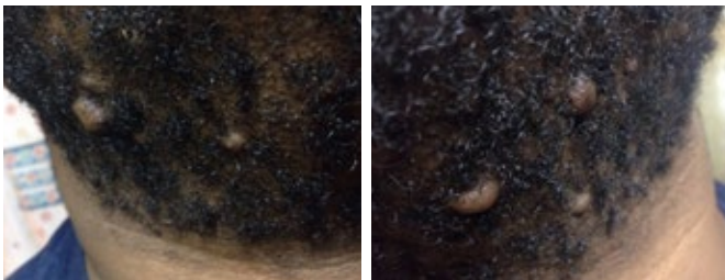
Figure 11. The same patient, December 2014, prior to undergoing surgery. Photographs from patient's own archives.

As shown in several cases, small papular and nodular keloids can be successfully removed using non-surgical treatments. On the other hand, keloid removal surgery imposes a major risk on all patients undergoing this intervention. Although no one has a crystal ball to predict the outcome of this patient's neck keloids had he been treated with ILT, ILC, and cryotherapy instead of surgery, patients like this young man should not be denied the chance for non-surgical treatment. Furthermore, surgery is a known cause for formation of these life changing massive keloids [2,3]. The following two cases presented in Figures 12-15 demonstrate