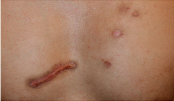
Figure 5. The same patients, after treatment with ILC (January 2016). Notice overall improvement, most importantly the complete regression of keloid papules in response to ILC.