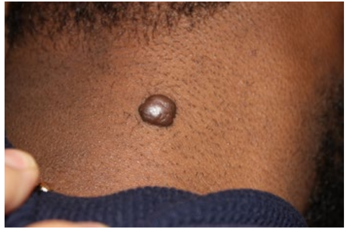
Figure 12. Early-stage nodular neck keloid in a 24-year-old African American male (December 2012).

the proof of the principle that small keloid lesions can be successfully treated using non-surgical tools. Several more site-specific examples of success of this treatment approach can be found within each site-specific Guidance document.