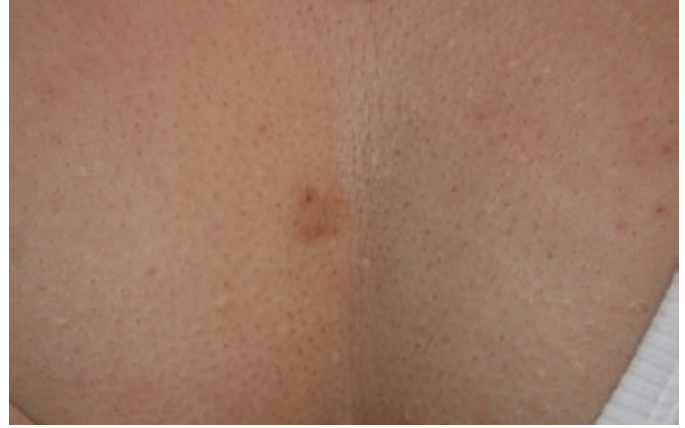
Figure 7. Same patient, April 2014. Note the total regression of the anterior chest keloid in response to treatment with ILT and cryotherapy.