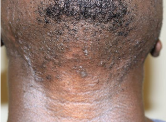
Figure 15. The same patient treated with ILK and ILC (June 2018). Note the significant improvement and near total regression of the treated area.