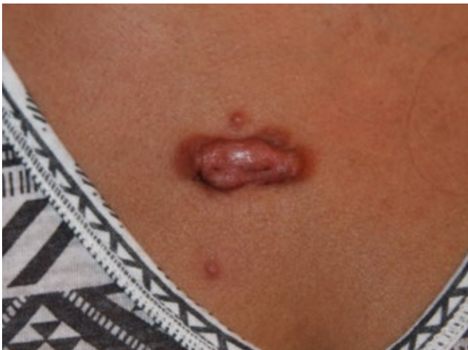
Figure 1. A 31-year-old Hispanic female (October 2014) with a tumoral anterior chest keloid. Note the presence of the inflammatory reaction around the margin of the main keloid and multifocal disease with two papular keloids in the immediate vicinity of the main lesion.

Although it is difficult to predict the fate of these two papules had they not been treated in 2014, what is indisputable is the fact that a durable remission was induced in the lower papule with a combination of ILT and cryotherapy: after close to three years of follow up, there was no keloid regrowth at that site.