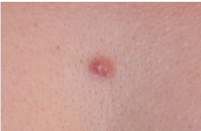
Figure 6. A 35-year-old Asian female with multifocal keloid disorder involving her face and shoulders with a solitary papule of anterior chest (June 2013).