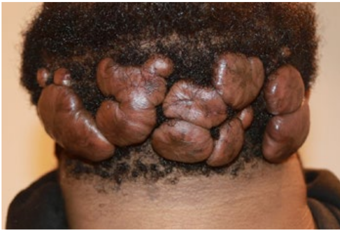
Figure 10. A 24-year-old African American male with multifocal, massive neck keloids (February 2017).

A 24-year-old African-American male presented in February 2017 with massive neck keloids (Figure 10). His struggles with KD started approximately four to five years earlier, when he first noticed several small keloid lesions forming on his upper neck and submental skin. The lesions were first treated with ILT and subsequently removed surgically in early 2015. Recurrent disease was noted soon after surgery and was treated with repeat surgery and post-operative ILT injections. Unfortunately, this approach was not successful and led to the development of massive submental keloids, as shown in Figure 10. The patient was asked to produce any prior images of his neck. Figure 11 depicts the size and location of his neck keloids prior to his first surgery.