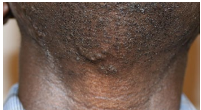
Figure 14. A 36-year-old African-American male with submental keloids (May 2016).