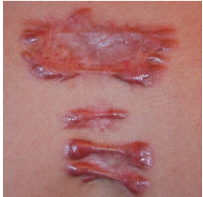
Figure 16. A 34-year-old Hispanic male with multiple large linear and flat central chest keloids.

Flat keloids, especially those located on anterior chest skin are among the most difficult keloids to treat. Figure 16 depicts a 34-year-old male who previously underwent two prior surgeries for treatment of anterior chest keloids. Currently, the only approach to keloid lesions like the one shown here is with ILC. Patients who present with such advanced keloids have often exhausted all available treatment options. Ideally all such patients need a systemic form of treatment that can be taken orally, or intravenously or a highly effective topical product that can be applied to all the diseased areas. Unfortunately, none is currently available.