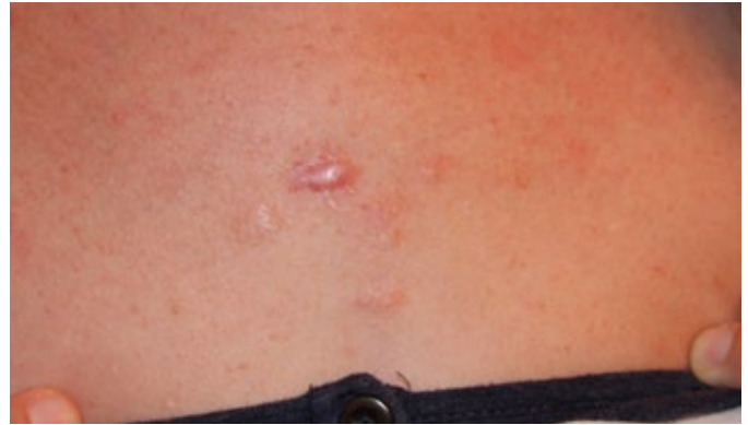
Figure 8. A 36-year-old Caucasian female with multifocal keloid disorder and a history of a few keloid papules on her chest. At presentation, several small papules had previously responded to ILK and lasers, with one particular lesion resisting treatment (September 2013).