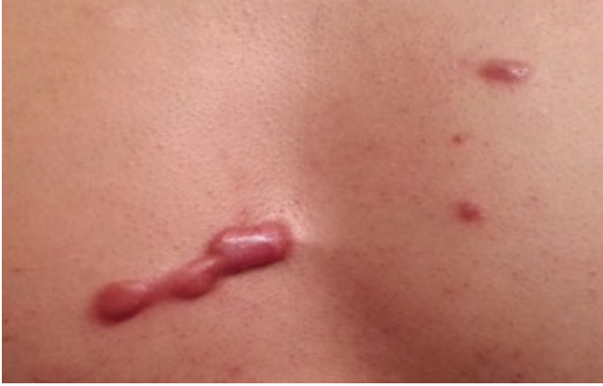
Figure 4. A 38-year-old Asian male with a thick linear and a few papular anterior chest keloids (Nov 2013).