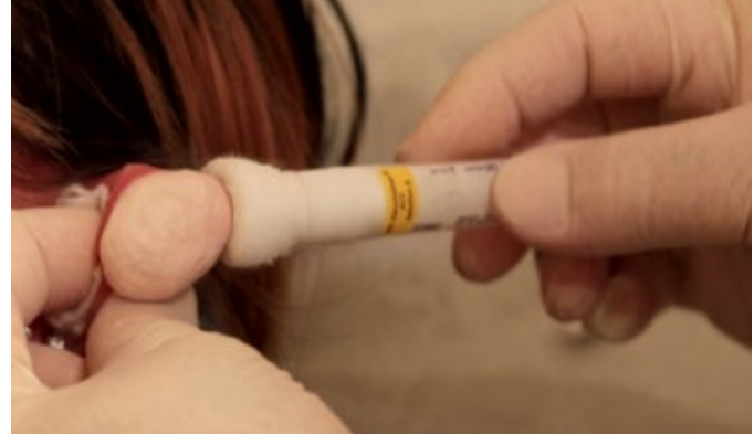
Figure 2. Custom made large cotton swab being used during the application of cryotherapy to a large ear keloid. The frozen keloid appears white.

Once all preparations are made and the keloid is ready for cryotherapy, the swab is dipped in liquid nitrogen and brought in contact with the keloid. The swab is gently pushed against the keloid and is held in place until the lesion starts to freeze. The frozen keloid tissue will appear white in color (Figure 2).