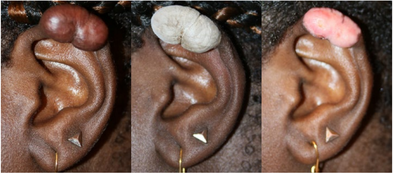
Figure 9. Ear keloid before (left) immediately after (center) and 41 days after application of cryotherapy (right). Note that the scab has already fallen off and there is lack of pigment at the treatment site. Also note the reduction in the mass of keloid after recovery from the first treatment. The necrosis and recovery cycle is now complete, and the patient is ready to receive the next course of cryotherapy.