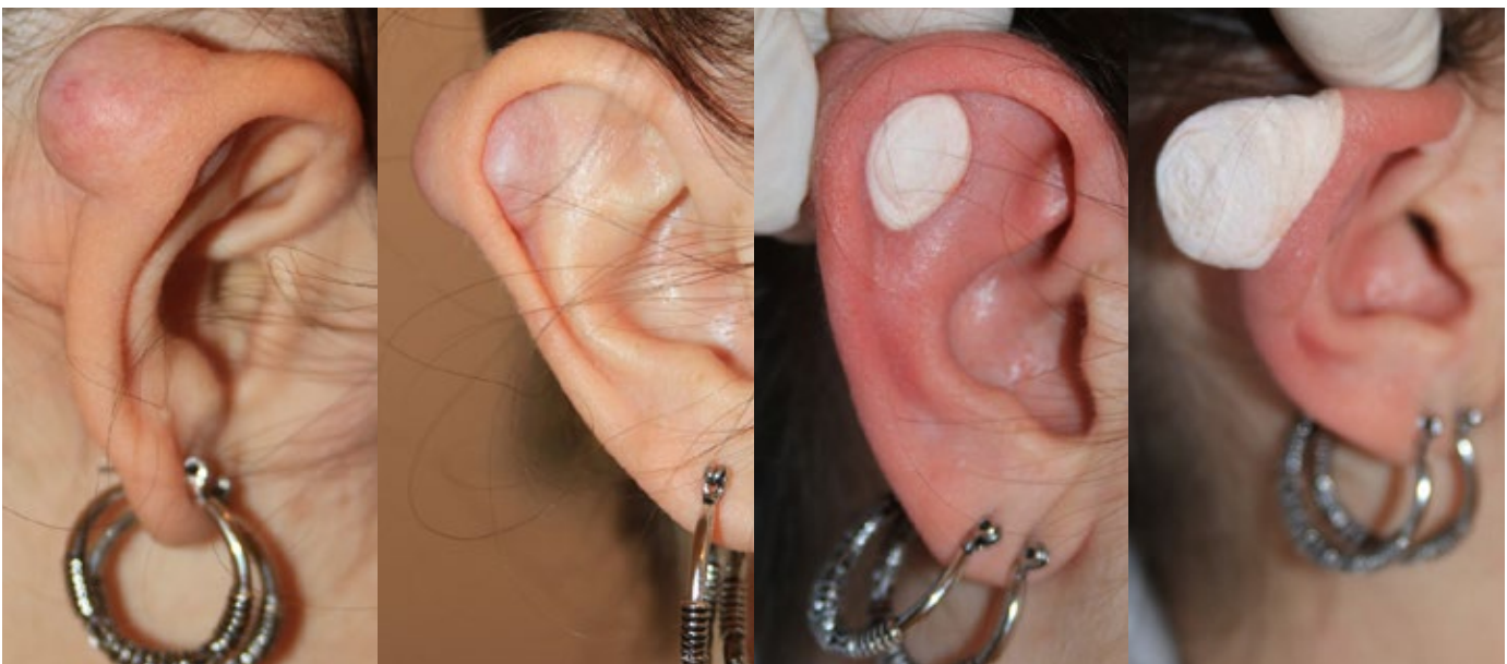
Figure 10. Ear keloid before and immediately after application of cryotherapy to both anterior and posterior segments of the keloid (Day 0).

Cryotherapy is an effective and safe method for treating bulky keloids. When performed correctly, significant debulking can be achieved, even with one cycle of cryotherapy (Figure 11). It is important to note that cryotherapy may not be a curative treatment for keloid disorder, but it is a safe method to reduce the mass of keloids and provide symptom relief and comfort to the patients.