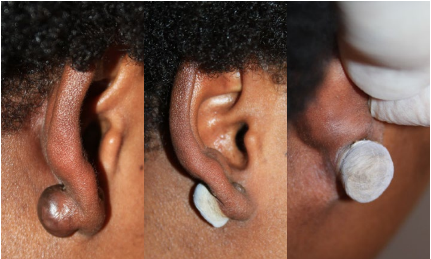
Figure 3. Earlobe keloid, before (left) and after application of cryotherapy (middle and right). The frozen keloid tissue appears white in color. In most cases, this size keloid can be treated without local anesthesia.

It is common sense that smaller keloids will freeze faster and will require fewer applications of liquid nitrogen. Larger keloids will obviously need a greater number of applications of liquid nitrogen in order to be properly and adequately frozen.