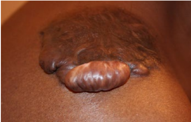
Figure 3. Tumoral keloid of right shoulder area in a 27-year-old African American male.