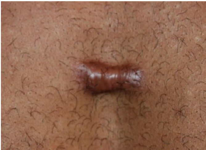
Figure 6. Central chest keloid in a 29-year-old male (April 2014).

combination of ILT and cryotherapy for which a partial response was achieved (Figure 7). At this point, decision was made to switch to ILC. Near complete remission was achieved and maintained using intermittent doses of IL-VCR at 2 mcg every few months.