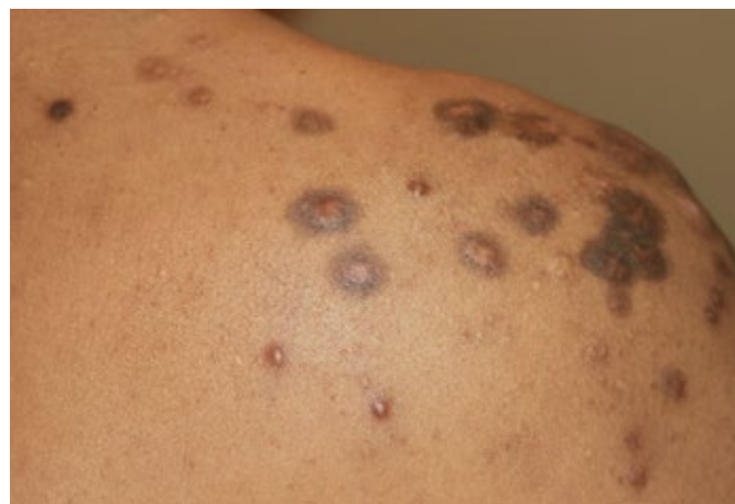
Figure 2. Typical ILC-induced hyperpigmentation.

When injected properly, IL-5-FU is well tolerated and does not cause any systemic or local side effects at the injection site. Repeated ILC injections using 5-FU, vincristine, or docetaxel, can all result in hyperpigmentation at the injection sites (Figure 2) in patients with dark skin color, Fitzpatrick skin type IV-VI.