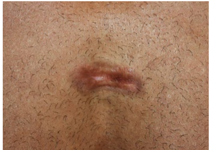
Figure 8. The same patient after six doses of ILC. Note the significant reduction in the mass (September 2015).