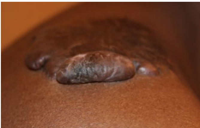
Figure 4. The same keloid, 21 days after a single injection of 10 mcg of IL-VCR. The keloid displays signs of tissue necrosis and volume loss. A second IL-VCR, 10 mcg, was injected during this visit.