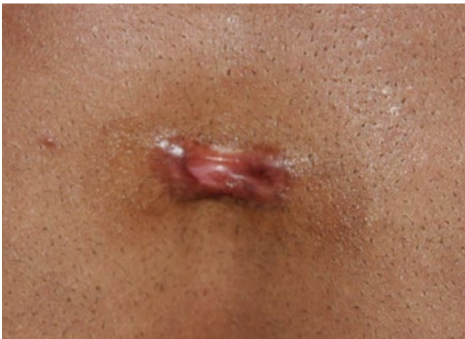
Figure 7. The same patient prior to initiation of ILC. Notice the reduction in the mass of keloid from prior ILT and cryotherapy (September 2014).