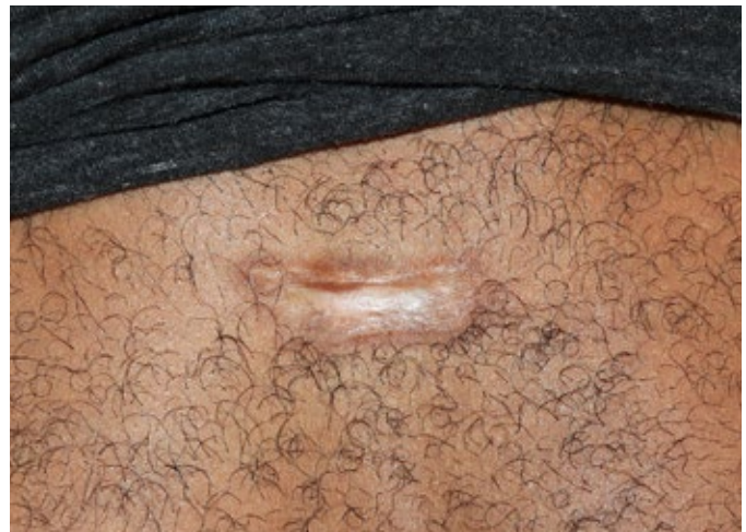
Figure 9. The same patient after several ILC injections (July 2018).